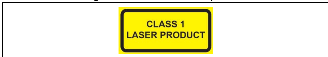
Figure 1. Label for Class 1 laser products

The VL53L0X contains a laser emitter and corresponding drive circuitry. The laser output is designed to remain within Class 1 laser safety limits under all reasonably foreseeable conditions including single faults, in compliance with IEC 60825-1:2014 (third edition). The laser output will remain within Class 1 limits as long as STMicroelectronics recommended device settings are used and the operating conditions, specified in the STM32L4 Series datasheets, are respected. The laser output power must not be increased by any means and no optics should be used with the intention of focusing the laser beam. Figure 1 shows the warning label for Class 1 laser products.