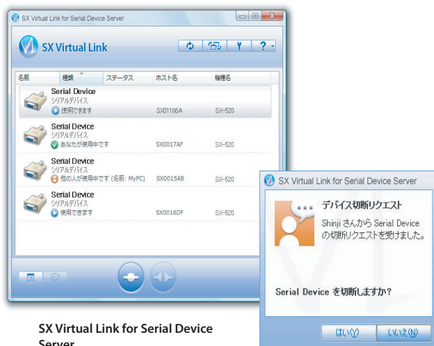
SX Virtual Link for Serial Device Server