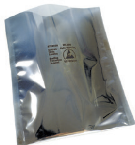
3M™ Metal-Out Static Shielding Bag1500

These bags are tested to meet or exceed certain electrical and physical requirements of ANSI/ESD S541 and to be ANSI/ESD S20.20 program compliant. Bags are RoHS Compliant* and lead-free**.