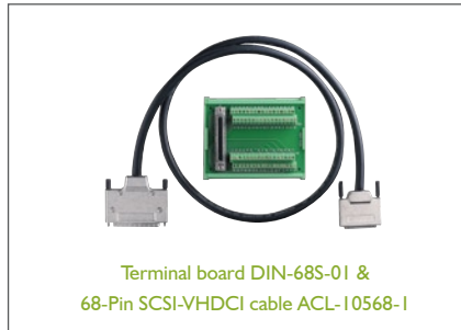
Terminal board DIN-68S-01 & 68-Pin SCSI-VHDCI cable ACL-10568-1

* For more information on mating cables, please refer to P2-61/62.