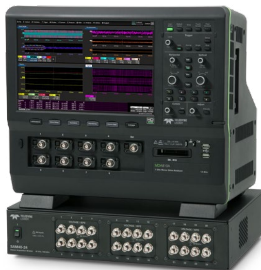
8 analog channel + 16 digital channel, 1 GHz, 12 bit resolution HDO8108 high definition oscilloscope with SAM40-24 provides 8+16+24 channel acquisition capability.