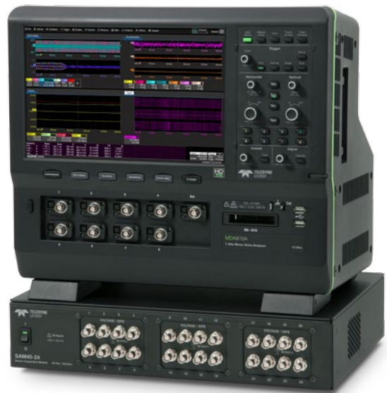
8 analog channel + 16 digital channel, 1 GHz, 12 bit resolution HDO8108 high definition oscilloscope with SAM40-24 provides 8+16+24 channel acquisition capability.

The most basic system available combines a 350 MHz, 500 MHz, or 1 GHz 12-bit resolution, 4 channel oscilloscope (HDO4000A or HDO6000A Series) with a SAM40-8 eight channel acquisition module. This triples the number of available inputs for a very modest price, and preserves high bandwidth oscilloscope inputs for the most important uses, or provides capability to view more high bandwidth signals than would have previously been possible without the SAM40. 16 and 24 channel acquisition modules may also be used. MSO oscilloscope models further add 16 digital logic input channels.