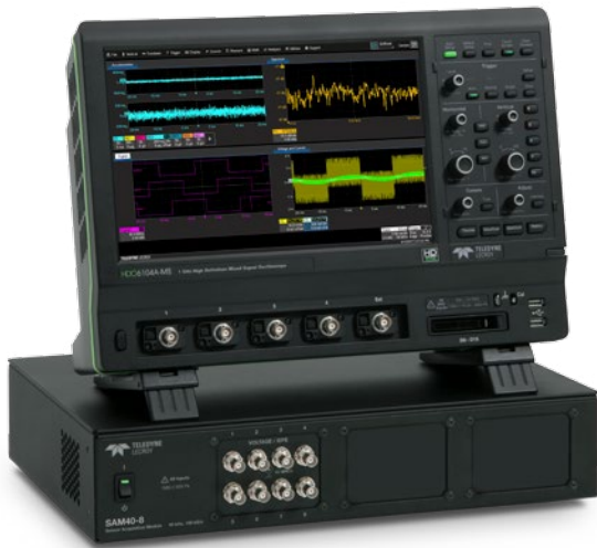
4 analog channel + 16 digital channel, 1 GHz, 12 bit resolution HDO6104A-MS high definition oscilloscope with SAM40-8 provides 4+16+8 channel acquisition capability.

Engineers commonly use multiple instruments to debug and validate complex deeply embedded control systems, mechatronics, and electro-mechanical systems. Multiple instruments report different information on different displays and in different formats. An HDO with a sensor acquisition module cost-effectively replaces multiple instruments with one consolidated view of system performance. Leverage the Teledyne LeCroy deep toolbox to perform math, measurements, pass/fail and other analysis on all acquired data, or apply an application package to gain even faster time to insight.