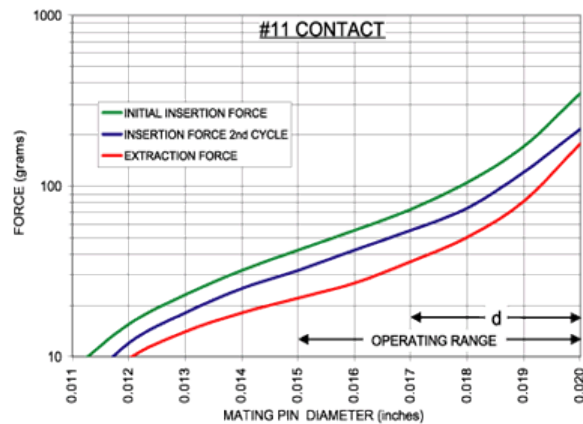
The insertion/extraction/normal force characteristics above were derived using a 30 microinch gold plated contact and polished steel gauge pins having a bullet-shaped tip.

†Since BeCu loses its spring properties over time at high temperatures; it is rated for continuous use up to 150°C. For applications up to 300°C, Mill-Max offers many contacts in Beryllium Nickel. Contact Tech Support for more info.