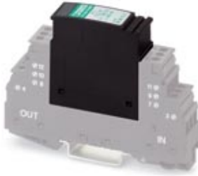
Surge protection plug for base element, for protecting a double conductor of analog telecommunication interfaces.

Please be informed that the data shown in this PDF Document is generated from our Online Catalog. Please find the complete data in the user's documentation. Our General Terms of Use for Downloads are valid ( http://download.phoenixcontact.com )