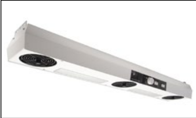
Figure 1. SCS 991A Overhead Air Ionizer