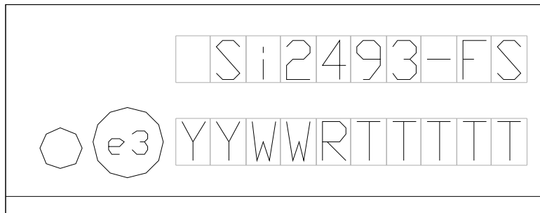
Figure 12. Si2493-D-FS Top Marking