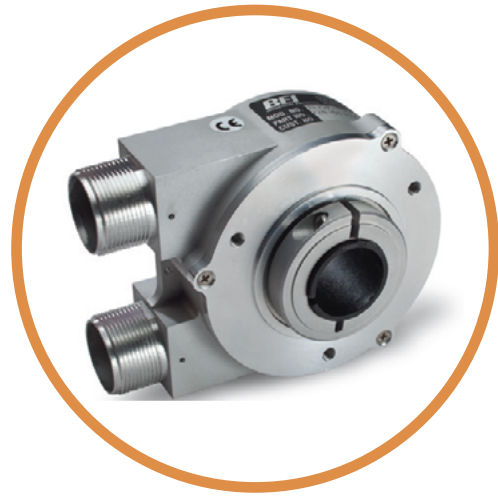
The HS35 Dual Output Encoder