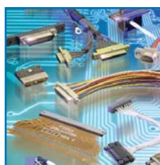
Microdot Connectors and Cables