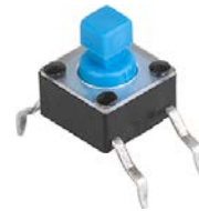
LPS: Through hole, square