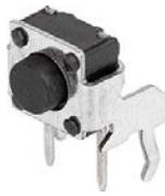
LPV: Through hole, angled