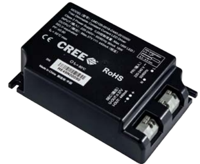
230 V Driver