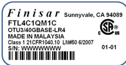
Figure 3 – FTL4C1QM1C production label