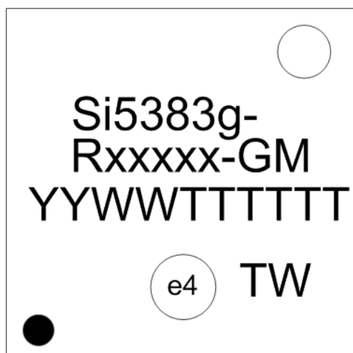
Figure 12.1. Si5383 Top Marking