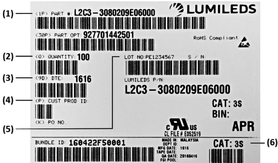
Figure 12. Example of inner box label for LUXEON CoB Core Range.

Notes for Figure 12 – Inner Box Label descriptions for customer use: Field labels not described are for Lumileds internal use only.