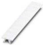
Zack marker strip, Can be ordered: Strip, white, Labeled according to customer specifications, Mounting type: Snap into tall marker groove, For terminal block width: 6.2 mm, Lettering field: 6.15 x 10.5 mm

Marker for terminal blocks - UC-TM 6 CUS - 0824589