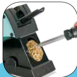
Stop & Go Safety Rest with dry cleaner accessories