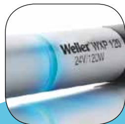
*LED Light Ring