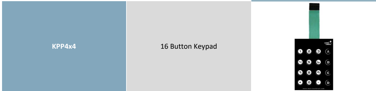
Table 73: Peripheral Accessories