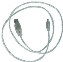
Figure 5: Mini USB Cable (EXTMUSB3FT)

The External Mini USB cable is recommended for the GLK240128-25-USB/GLT240128-USB display. It will connect to the miniB style header on the unit and provide a connection to a regular A style USB connector, commonly found on a PC.