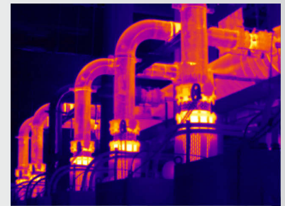
MultiSharp Focus, available on the Ti450 PRO