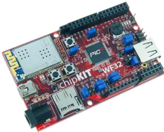
The chipKIT WF32 board.

The chipKIT WF32 is based on the popular Arduino™ open-source hardware prototyping platform and adds the performance of the Microchip PIC32 microcontroller. The WF32 is the first board from Digilent to have a WiFi MRF24 and SD card on the board both with dedicated signals. The WF32 board takes advantage of the powerful PIC32MX695F512L microcontroller. This microcontroller features a 32-bit MIPS processor core running at 80Mhz, 512K of flash program memory, and 128K of SRAM data memory.