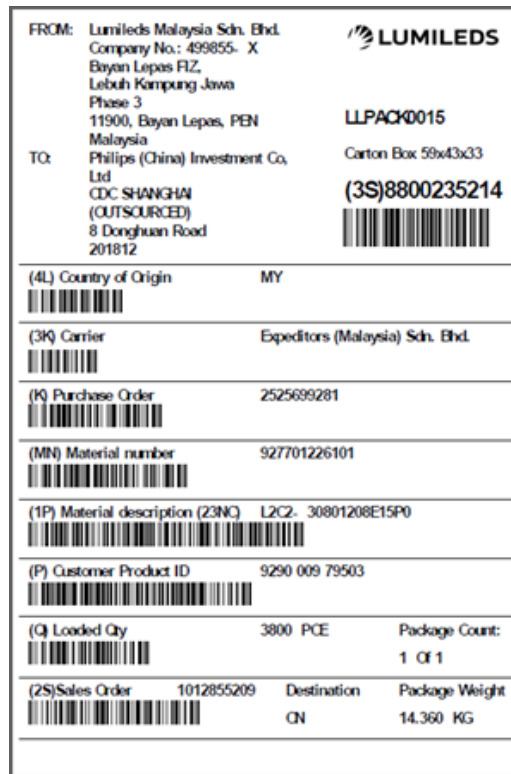
Figure 14. Example of outer box label for LUXEON CoB Core Range (Gen2).