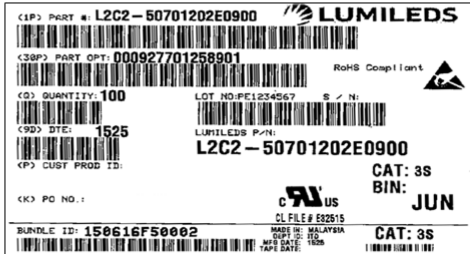
Figure 12: Example of inner box label for LUXEON CoB Core Range (Gen2).