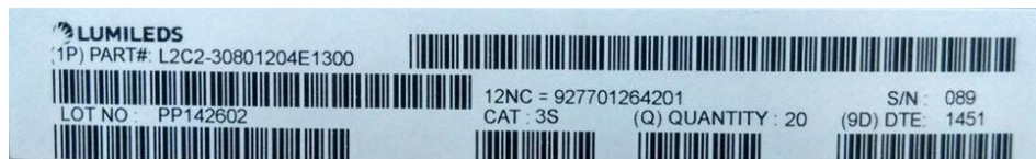
Figure 10: Example of a tube label.