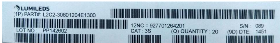
Figure 10: Example of a tube label.