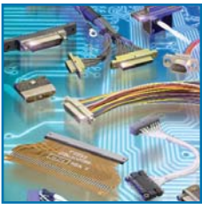
Microdot Connectors and Cables