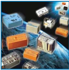
Schrack PCB Relays