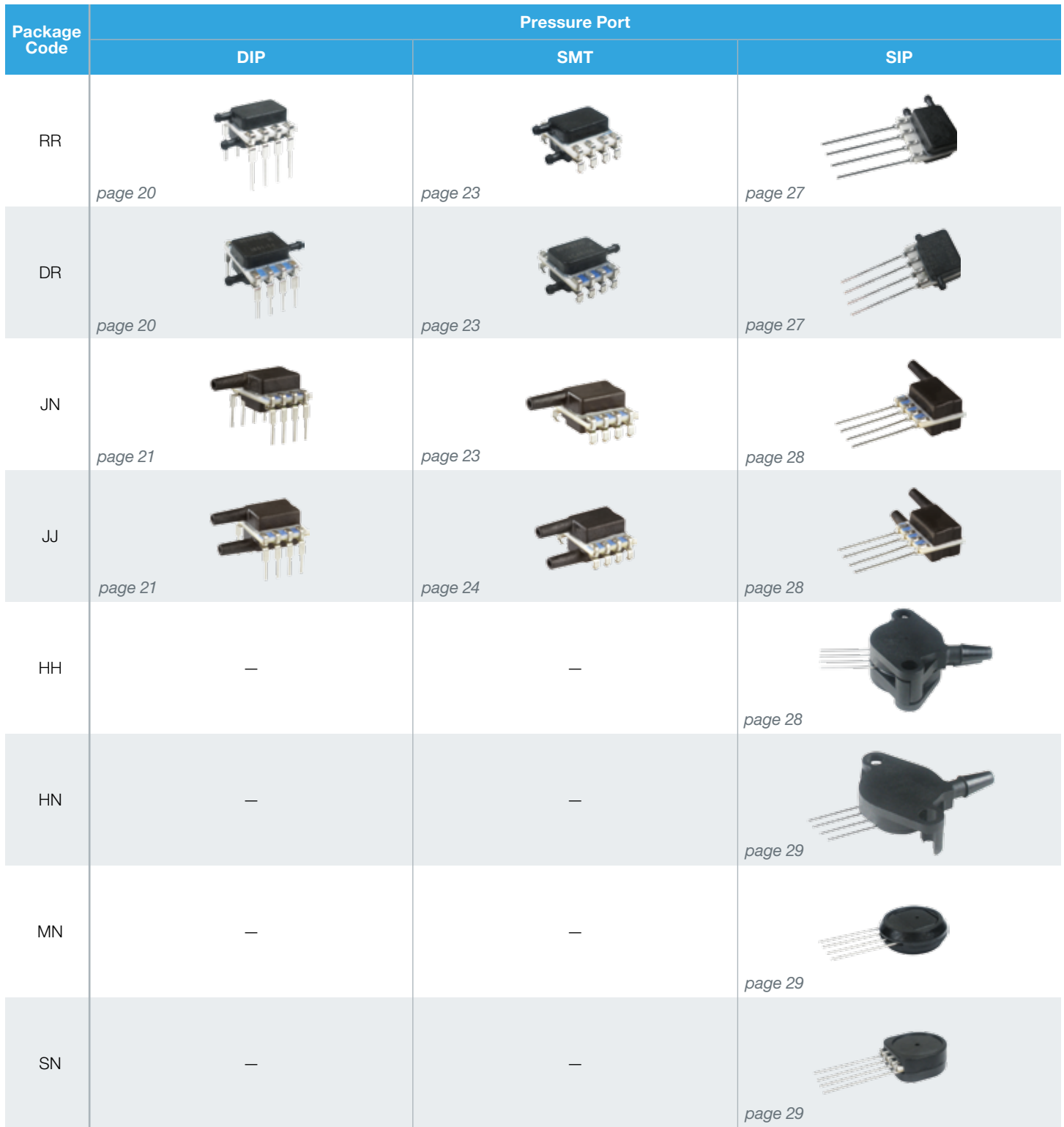
Figure 5. All Available Standard Configurations (Continued; dimensional drawings on pages noted below.)