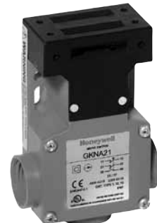
GKN Series Safety Interlock