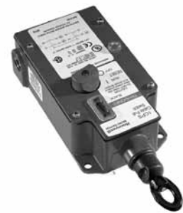
CPS Series Cable Pull Safety Switch