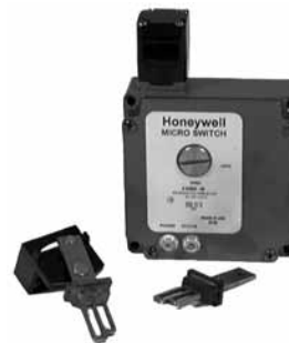
GKR/L Dual-Entry Solenoid Safety Interlock