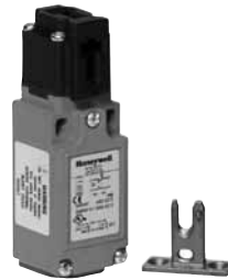
GKE Series Dual Entry Safety