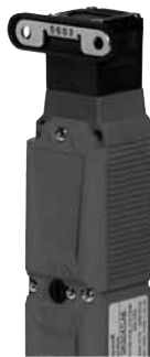
GKS Series Multi-Entry Trapped Safety Interlock