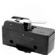
BZ, BA, BM, BE Series