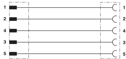
Contact assignment of the 7/8" connector and the 7/8" socket