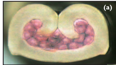
Cross Sections Showing Minimum (a) and Maximum (b) Area Index per Terminal Specification—a Variation of \pm 3.5\%

Therefore, varying the CW by 2% would result in a CH variation of 2%, or 0.0014 in. At a CH tolerance of \pm 0.002 in, 35% of the total CH tolerance would be used by a 2% variation in CW. Thus, the importance of crimp width control is obvious when tooling is changed during a production run.