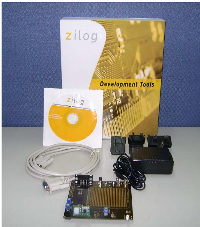
Figure 1. ZMOTION Detection Module Evaluation Kit Components