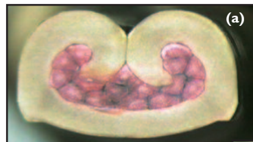
Cross Sections Showing Minimum (a) and Maximum (b) Area Index per Terminal Specification—a Variation of \pm 3.5\%

Therefore, varying the CW by 2% would result in a CH variation of 2%, or 0.0014 in. At a CH tolerance of \pm 0.002 in, 35% of the total CH tolerance would be used by a 2% variation in CW. Thus, the importance of crimp width control is obvious when tooling is changed during a production run.