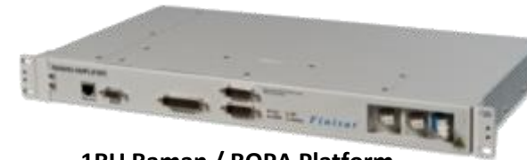
1RU Raman / ROPA Platform

Finisar’s Ultraspan® family of Raman and ROPA optical amplifiers offer the power of optical amplification in a user-friendly, network-interfaced, rack-mountable platform ideal for field deployment and integration in new or existing network elements. Ultraspan amplifiers can provide stand-alone amplification or work in conjunction with existing systems, complementing or enhancing their performance capabilities.