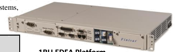
1RU EDFA Platform

Finisar’s UltraSpan® family of optical amplifiers offers the power of optical amplification in a user-friendly, network-interfaced, rack-mountable platform. They are ideal for field deployment and integration in new or existing network elements. Ultraspan amplifiers can provide stand-alone amplification or work in conjunction with existing systems, complementing or enhancing their performance capabilities.