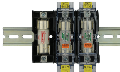
Fuses not included.