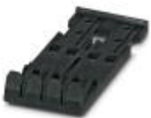
Strain relief, Number of positions: 4, Color: black