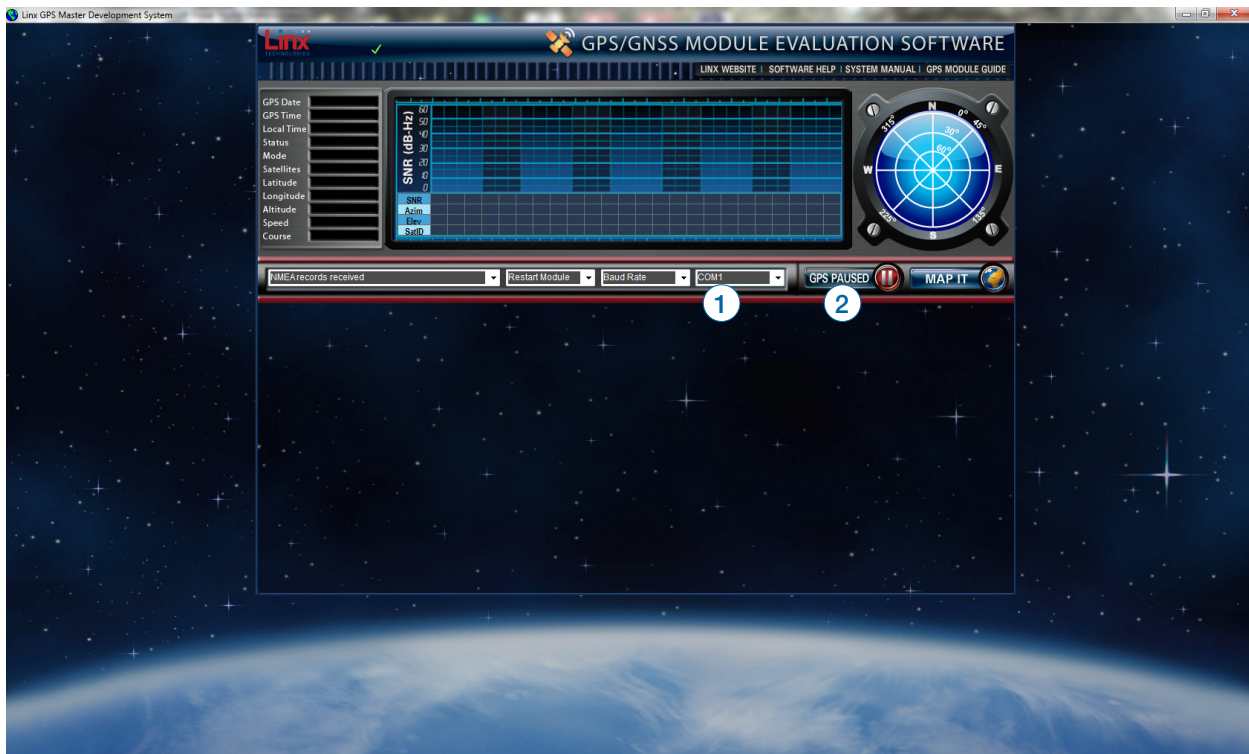
Figure 1: The Initial Screen

When the program starts, the screen in Figure 1 appears.