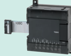
CP1W-TS001 Thermocouple inputs: 2 CP1W-TS002 Thermocouple inputs: 4 CP1W-TS101 Platinum-resistance thermometer inputs: 2 CP1W-TS102 Platinum-resistance thermometer inputs: 4