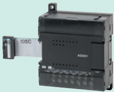
Analog Input Unit CP1W-AD041 Analog inputs: 4 (resolution: 6,000)