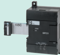
CP1W-SRT21 Inputs: 8 bits Outputs: 8 bits