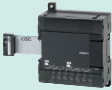
Analog I/O Unit CP1W-MAD11 Analog inputs: 2 (resolution: 6,000) Analog outputs: 1 (resolution: 6,000)