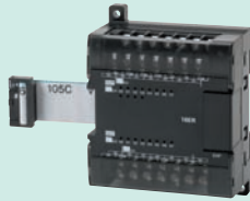
CP1W-16ER Relay outputs: 16