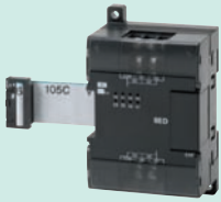
CP1W-8ED DC inputs: 8