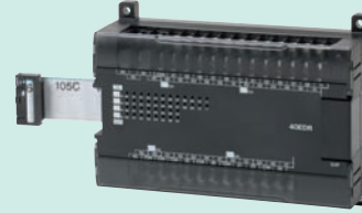
CP1W-20EDT DC inputs: 12 Transistor outputs (sinking): 8