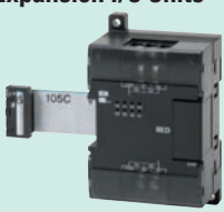
CP1W-8ED DC inputs: 8