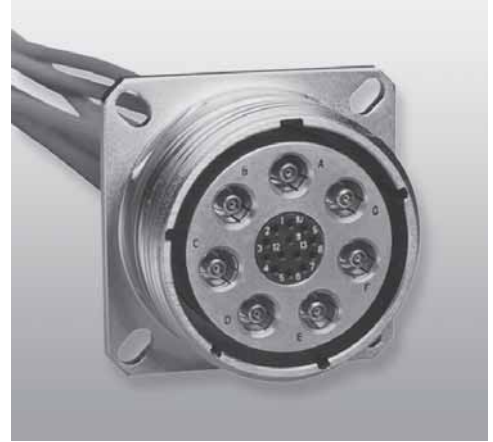
Ground Plane Connector with Metallic Insert, Power Contacts and Shielded Twinax Contacts

For further information on RCT contacts, consult catalog 12-130.