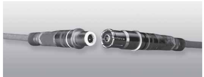
Size 8 Concentric Twinax Contacts Qualified to M39029/90 and /91 (Also available in Size 12)