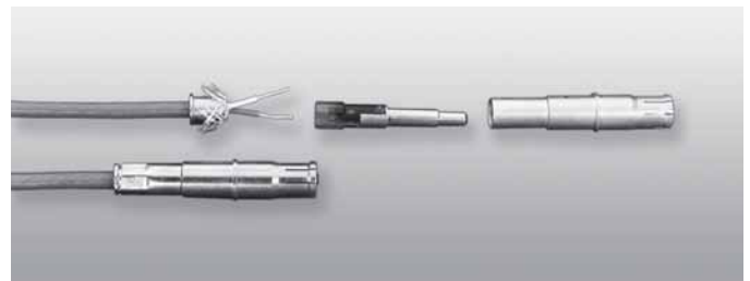
Size 8 RCT (Reduced Component Twinax) Contact (Also available in Size 10)