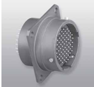
JT with Filter Protection

Filter and/or voltage surge arresting devices are integrated into a JT or an LJT connector to eliminate conventional bulky exterior filtering systems. This unique design reduces weight, space and user testing while providing system protection from EMI/ EMP. Ask for publication 12-120 or contact Amphenol, Sidney, NY for complete information on Amphenol EMI Filter/Transient Protection Connectors.