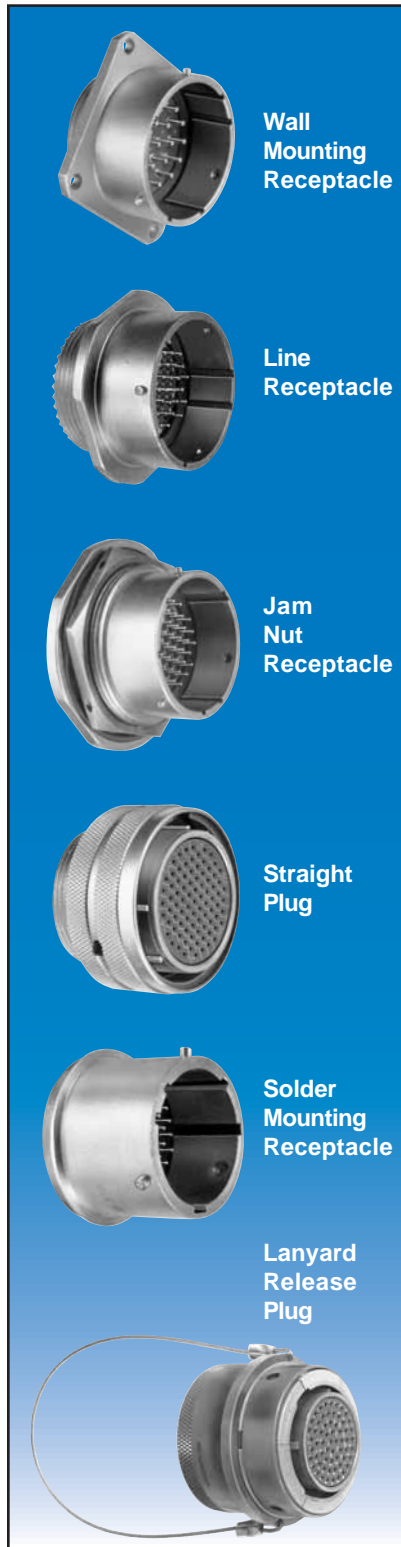
Wall Mounting Receptacle