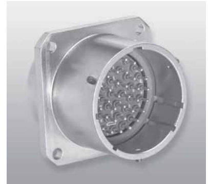
LJT with Filter Protection