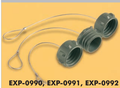
EXP-0990, EXP-0991, EXP-0992