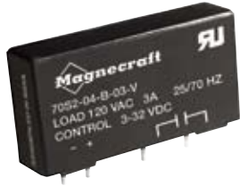
70S2 V (3 Amp)