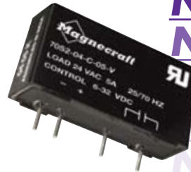
70S2 V (5 Amp)