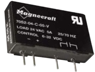
70S2 V (5 Amp)