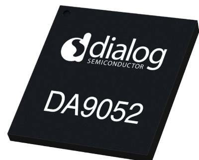
VFBGA 7 mm x 7 mm, 0.5 mm pitch package

An integrated 10-channel general purpose ADC includes support for a touch screen controller with pen down detect, programmable high/low thresholds, an integrated current source for resistive measurements, and system voltage monitoring with a programmable low voltage warning. The ADC has 8-bit resolution in auto mode and 10-bit resolution in manual conversion mode.