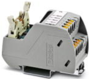
VARIOFACE Professional (VIP) board for the ROC800 controller

Please be informed that the data shown in this PDF Document is generated from our Online Catalog. Please find the complete data in the user's documentation. Our General Terms of Use for Downloads are valid ( http://phoenixcontact.com/download )