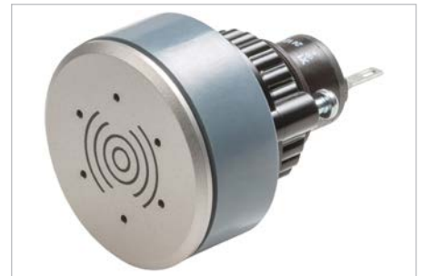
Product can differ from the current configuration.