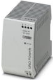
Primary-switched UNO power supply for DIN rail mounting, input: single-phase, output: 12 V DC/100 W

Please be informed that the data shown in this PDF Document is generated from our Online Catalog. Please find the complete data in the user's documentation. Our General Terms of Use for Downloads are valid ( http://phoenixcontact.com/download )