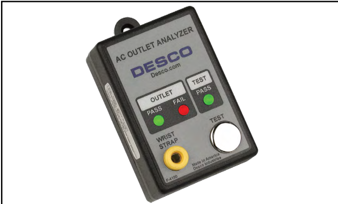
Figure 1. Desco 98132 AC Outlet Analyzer and Wrist Strap Tester