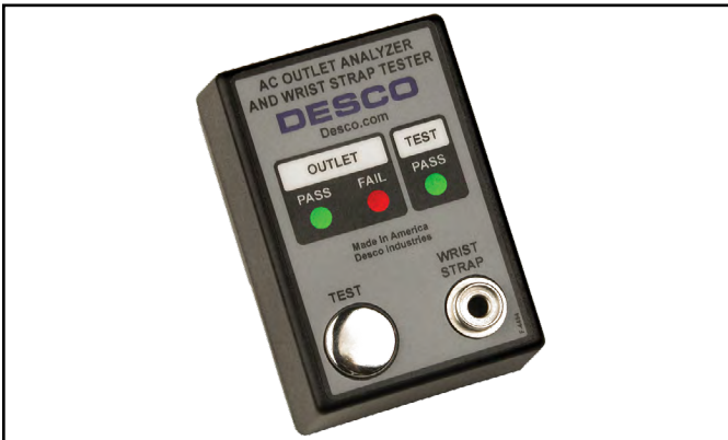
Figure 2. Desco 98131 AC Outlet Analyzer and Wrist Strap Tester