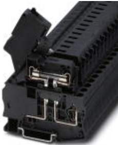
Lever-type fuse terminal block, black, for 6.3 x 32 mm G fuse inserts, with LED for 60 V DC

Please be informed that the data shown in this PDF Document is generated from our Online Catalog. Please find the complete data in the user's documentation. Our General Terms of Use for Downloads are valid ( http://download.phoenixcontact.com )