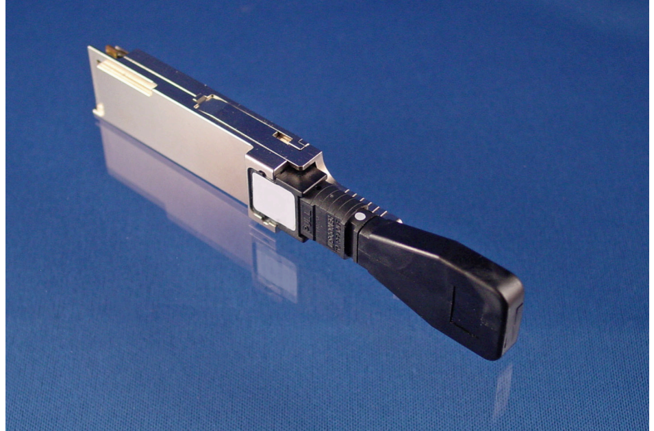
MPO Loopback with QSFP transceiver