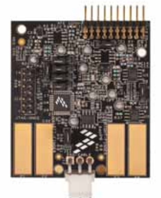
Figure 4: MED-EKG with Default Jumpers Used in Table 2

Verify the MED-EKG module is configured to default settings. This is required to run the MED-EKG demo.