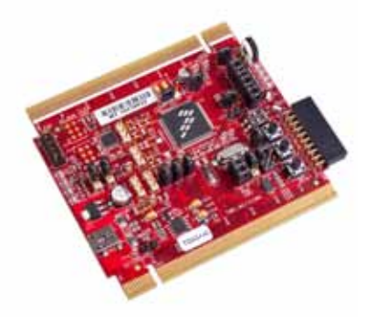
Figure 3: TWR-MCF51MM with Default Jumpers Used in Table 1

Verify the default jumper settings for the TWR-MCF51MM module. Some labs require default settings, please refer to Table 1.